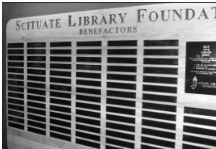
The Benefactor's Board in the Scituate Library.

The specially designed name plaques for the Benefactor's Board are $1,000 each and if requested, can be payable over an extended period of time (contact SLF for details).